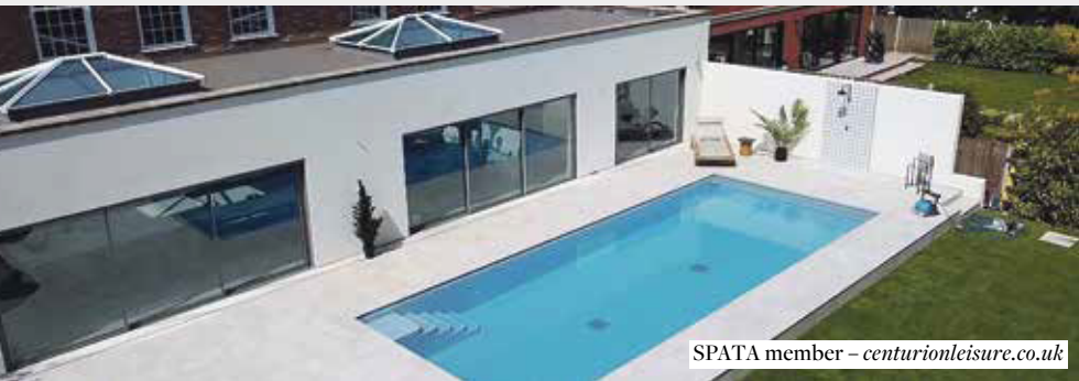
SPATA member – centurionleisure.co.uk

A swimming pool is a luxurious addition to any home – a space to exercise and improve your health and wellbeing, and whether indoors or outdoors, it's a social space to spend time with family and friends.