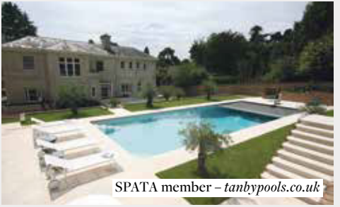
SPATA member – tanhyppools.co.uk

To learn more about SPATA, get design inspiration and connect with one of their members, visit spata.co.uk